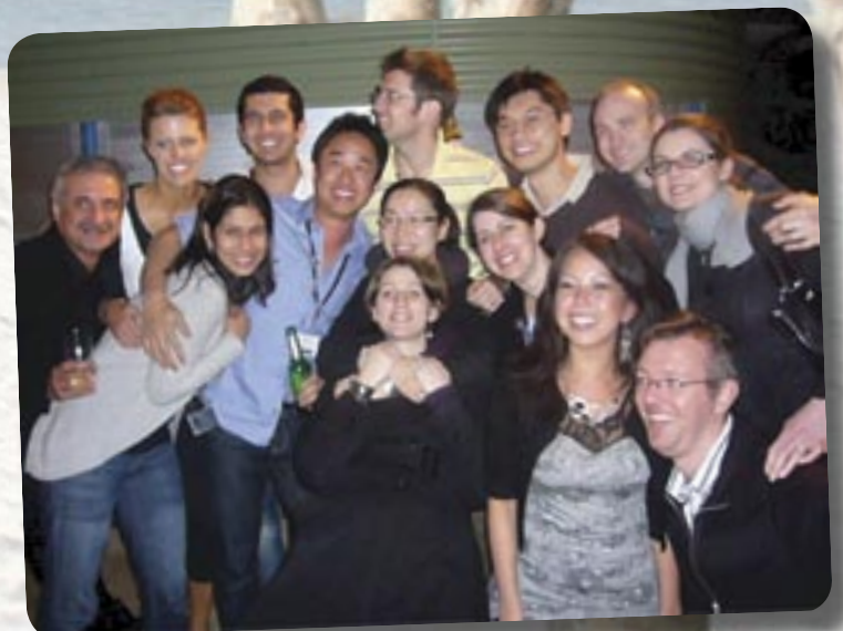
Corporate Patrons 3M Unitek Supporting the Treat - Fraser Island